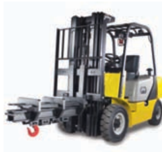
Fork Mounted Crane