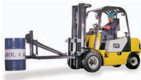
Drum Handling Parrot Beak