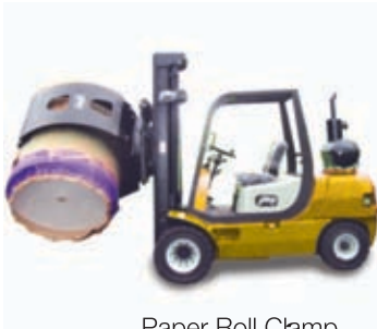
Paper Roll Clamp